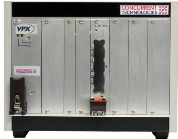
Option Example: Development System (with a processor board)