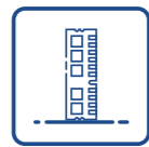
EPE rugged bus